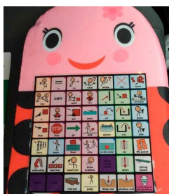
On boogie board

1- Accessibility: Ensure that the AAC system the person is using is always accessible and within reach, so that you can model and use it with person at any time, anywhere. If the person is using a high tech AAC system, you may also want to print out hard copies of the main page, or have additional light tech systems for activities and environments that are not suitable for electronics. Below are some examples: